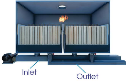
Third generation (8/12-Bed RTO)